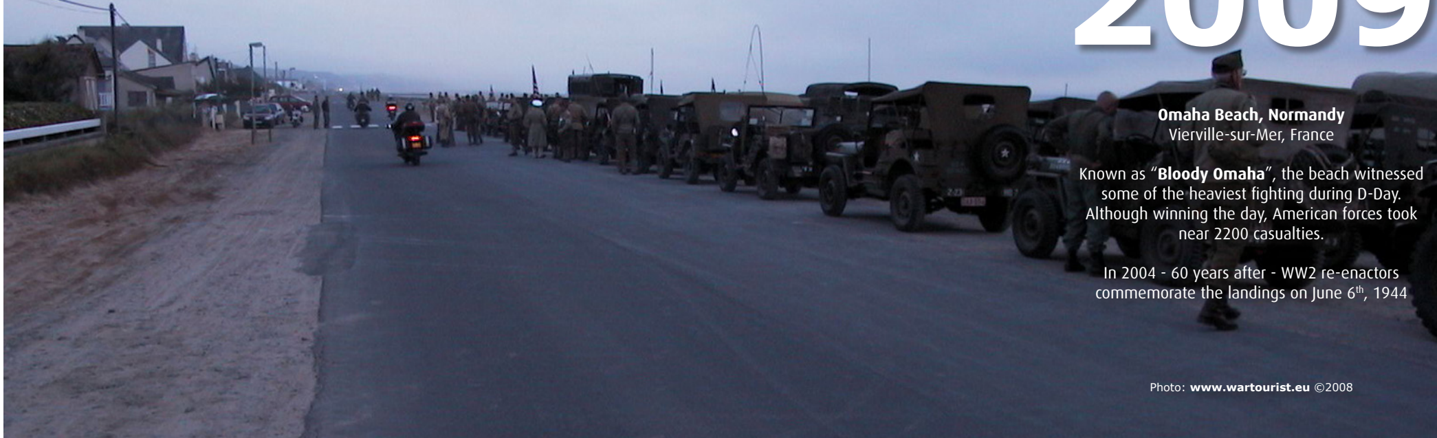
Omaha Beach, Normandy Vierville-sur-Mer, France

Known as “ Bloody Omaha ”, the beach witnessed some of the heaviest fighting during D-Day. Although winning the day, American forces took near 2200 casualties.