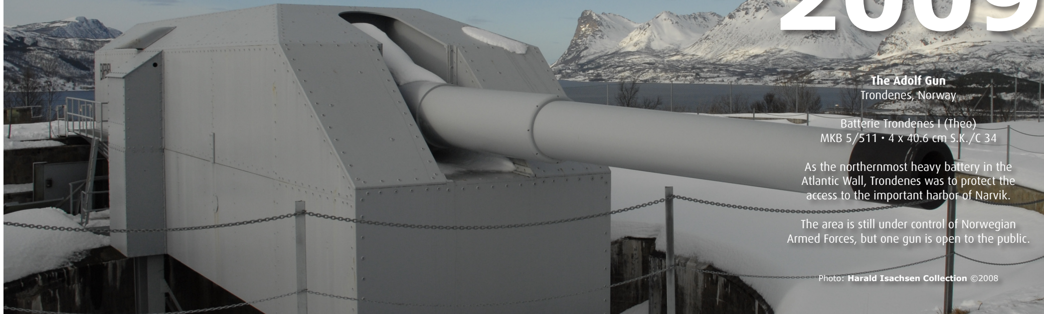
The Adolf Gun Trondenes, Norway

Batterie Trondenes I (Theo) MKB 5/511 · 4 x 40.6 cm S.K./C 34