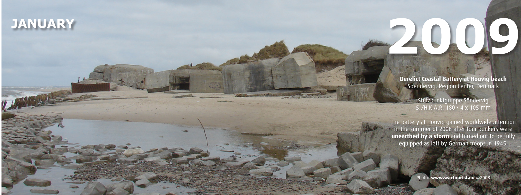
Derelict Coastal Battery at Houvig beach Soendervig, Region Center, Denmark

Stützpunktgruppe Söndervig 5./H.K.A.R. 180 • 4 x 105 mm